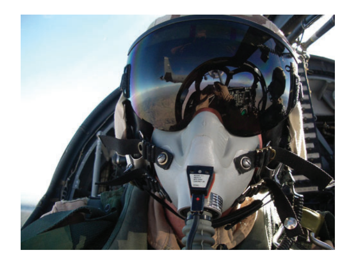
Figure 16-4 Laser eye protective film on the visor of an aircrew helmet.

NVGs are electro-optical sensors, which use an image intensifier tube to amplify visible and near infrared light energy. The image intensifier converts incident photons into electrons, which are then multiplied and converted back into viewable photons.44 The result of this intensification process provides the user with a two-dimensional, monochromatic image of the nighttime scene. Most importantly, the scene detail is increased from a 20/200 to 20/400 scotopic (ie, nighttime) image to near-photopic (ie, daytime 20/30) visual acuity levels.<sup>44</sup> Just as the human eye's spatial discrimination varies with illumination and contrast, so too does the NVG image quality. Actual acuity with NVGs depends on the NVG specifications and the night environment. Military specifications for NVG acuity can vary, but most NVG systems provide 20/30 visual acuity or better under ideal environmental conditions and after proper focusing techniques.