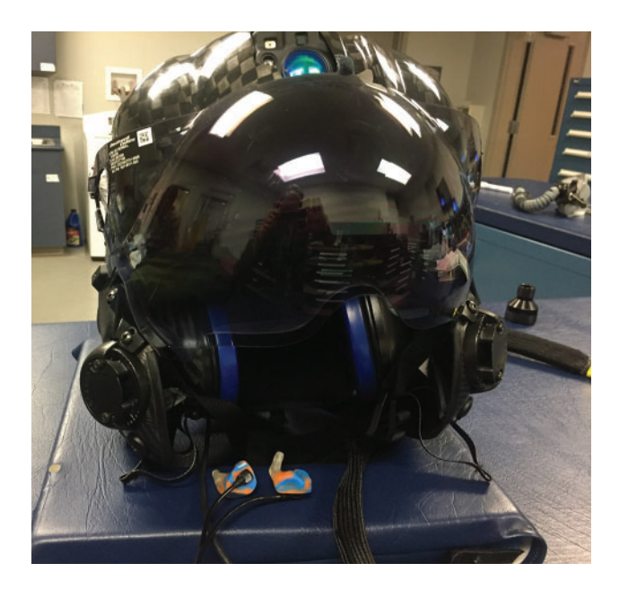
Figure 16-3. Aircrew helmet with communicating ear plugs.

After several days of partial or interrupted sleep, most people suffer some degree of impaired performance.<sup>16</sup> Long-range flight operations and multiple-day missions are operational realities in military aviation.